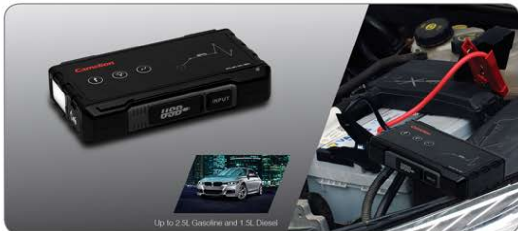
Up to 2.5L Gasoline and 1.5L Diesel

CJS60 Auto Jump Starter & Mobile Power is powered by a special designed High Rate Discharge Lithium-Polymer Battery, providing great power in a small portable package. Designed with the patented safety protection technology, we ensure your safety when jump starting your vehicles. The jump starter can help you start up a car with a dead battery, and can also serve as a mobile power to charge your devices or a LED flashlight.