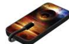
10000mAh Mobile Power