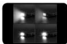
4 Lighting Modes