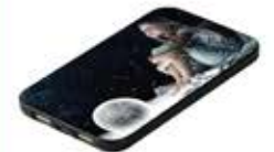
PS671 Mobile Power