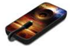
PS674 Mobile Power