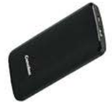
PS656 Mobile Power