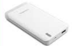
PS675 Mobile Power